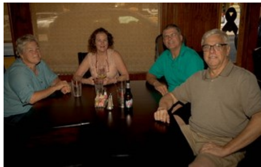
The Before and After