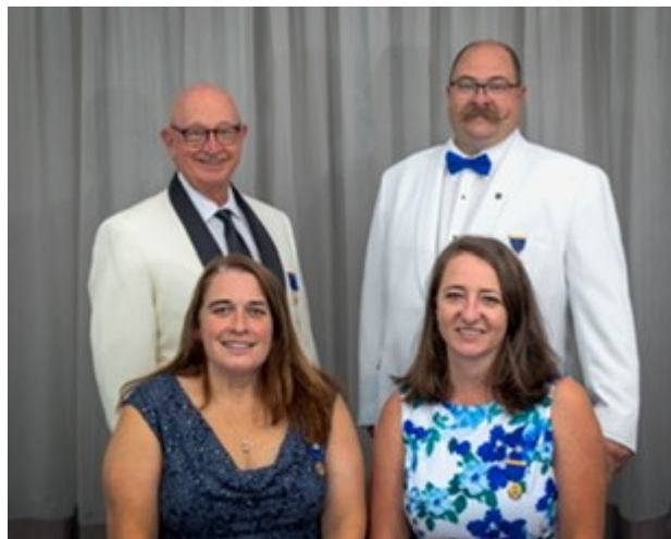
2022-2023 Grand Nest Officers

defend the ders from crashers at Grand Ball