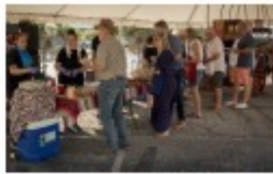
Welcome Wagon Dinner