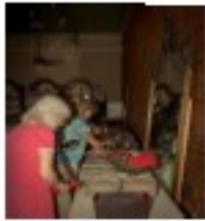
Grand Nest Officer & DMLGG Dinner

116 th Honorable Order of Blue Goose International Convention July 10-14, 2022 Grapevine, Texas